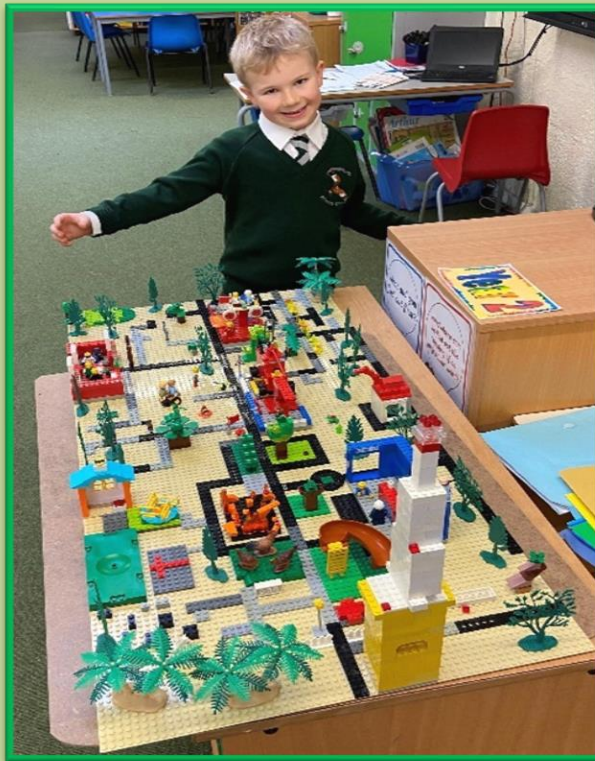
☺ THE OS MAP OF STOKENCHURCH CAME TO LIFE THIS WEEK...IN LEGO! ☺

THIS WEEK: COMIC RELIEF Y5 BIKEABILITY DISCO NETBALL MATCH SCIENCE CLUB Y4 ASSEMBLY IMPORTANT MESSAGES DATES FOR YOUR DIARY AND MUCH MORE...☺