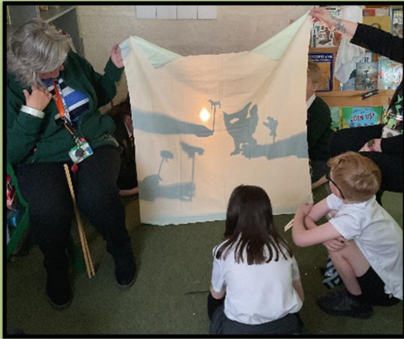
😊 SHADOW PUPPETRY IN Y3 THIS WEEK 😊