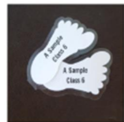
Peel & Stick Shoe Labels

5 Name Labels £ 1.00 10 Name Labels £ 1.75 15 Name Labels £ 2.50