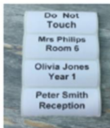
Peel & Stick Labels

10 Labels £ 2.00 20 Labels £ 3.50 30 Labels £ 5.00