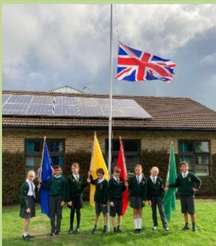
☺ OUR NEWLY ELECTED HOUSE CAPTAINS 2022-23 ☺

THIS WEEK: CONGRATULATIONS WELCOME MEETINGS SINGING RETURNS! LUNCH UPDATE IMPORTANT MESSAGES DATES FOR YOUR DIARY AND MUCH MORE...☺